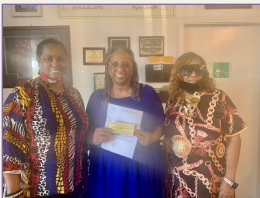
Inglewood Pacific Links Chapter Members donating Christmas' gifts to two of our families and a COVID check for our agency!!! https://www.ipclinks.org/